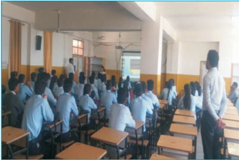
Seminar on E-Marketing