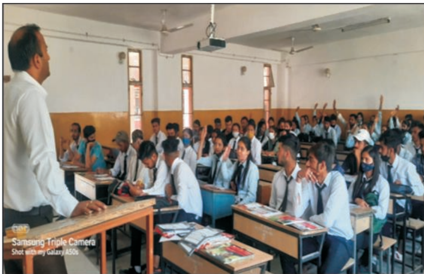
Students Interacting during Seminar