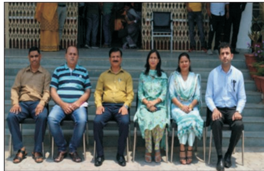
Faculty of BBA