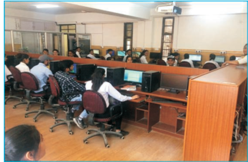
BCA students busy with their lab work