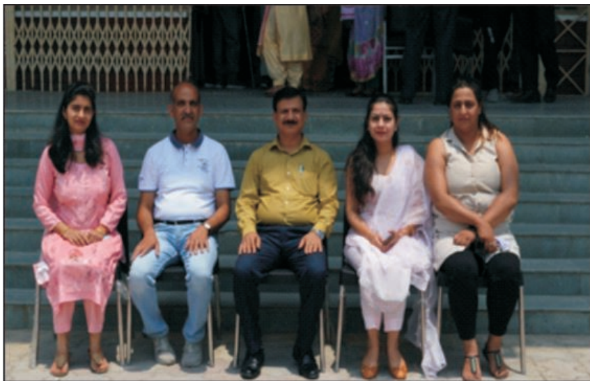
Faculty of BCA