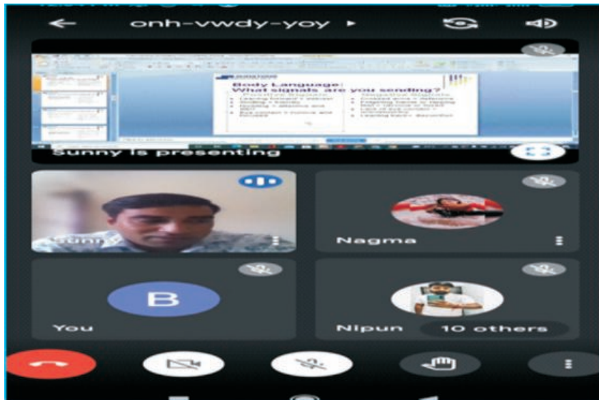
Online Webinar on SEBI