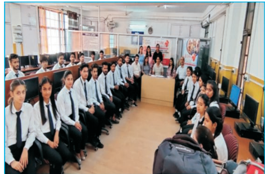
BCA & BBA students alongwith the faculty after the job placement drive