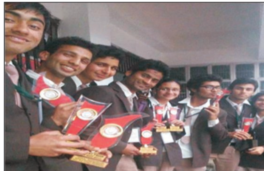
Price Winners of Management fest